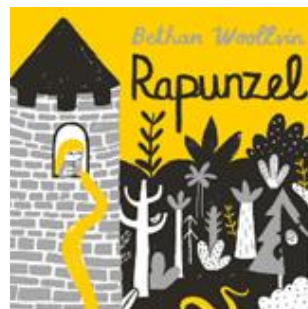
Rapunzel by Bethan Woolrin