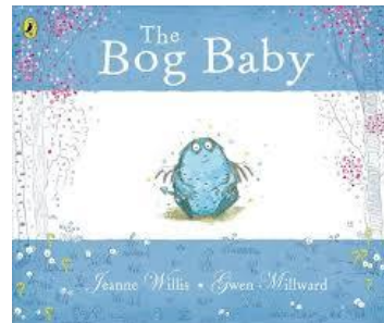
The Bog Baby